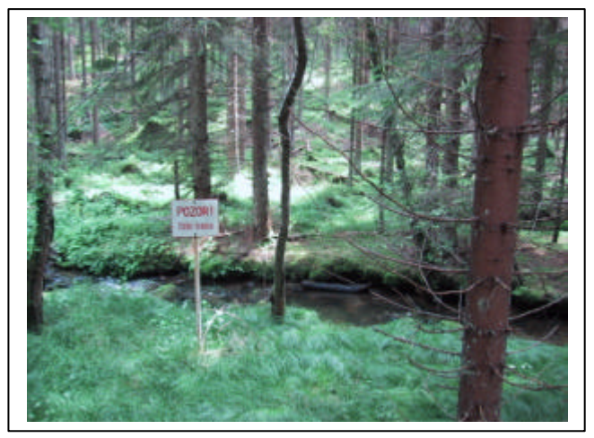
cross the border-brook at the sign

leave the road at the clearing with the circuit-line, take the carriage road to the right