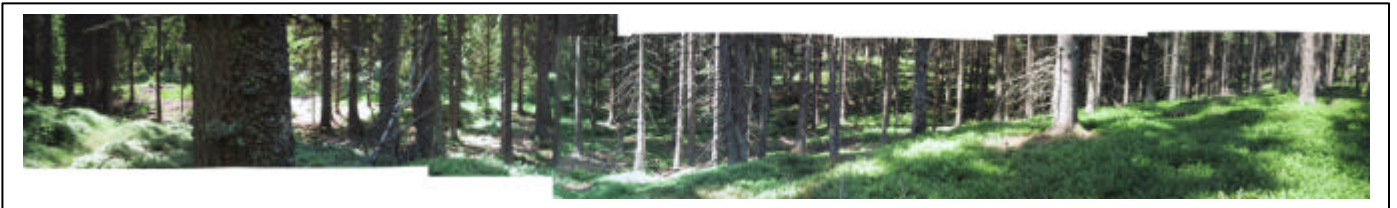
cross the border-brook at the sign and follow the small foot-path into the wood