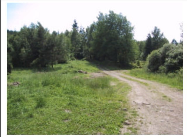
turn left the second junction in the centre of Mnichovice