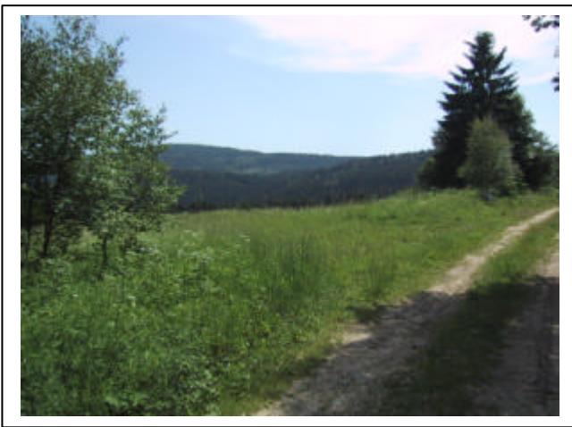
leave the road at the clearing and walk down the slope to the left